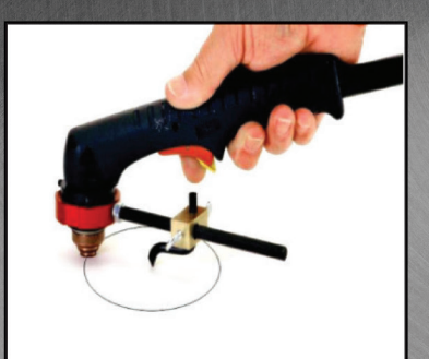
Plasma Wiz #30061