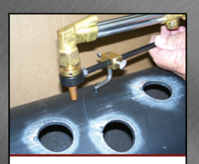
Circle Wiz #CW-300