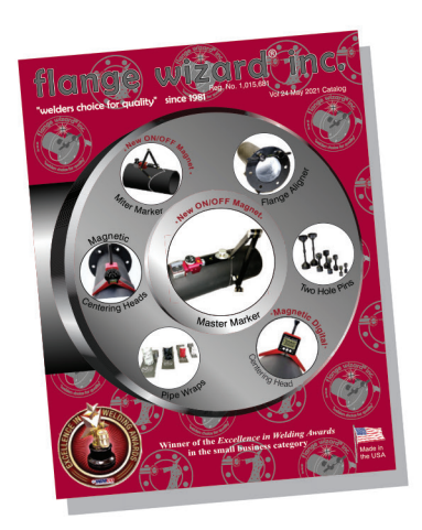
SCAN THE QR CODE TO ACCESS THE FULL FLANGE WIZARD CATALOG