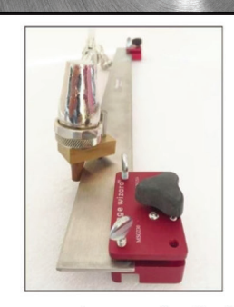
Magnetic Torch Guide #MSG230