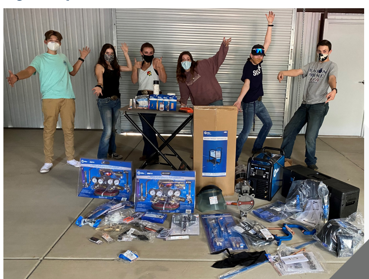
Students from Union Mine High School in El Dorado, CA pose with their new welding equipment package.

The AWS Foundation's newest grant program offers a welding equipment package valued at $10,000 to high schools that do not currently offer welding. Recipients were: