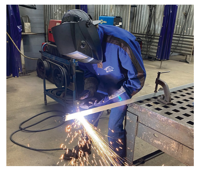
Student from Kankakee Area Career Center applies plasma arc cutting on angle stock.

Mifflin County Academy of Science & Technology - Lewistown, PA Mount Pleasant High School - Columbia, TN Paso Robles High School - Paso Robles, CA Somerset Community College - Somerset, KY Texarkana College - Texarkana, TX Waubonsee Community College - Sugar Grove, IL York County School of Technology - York, PA